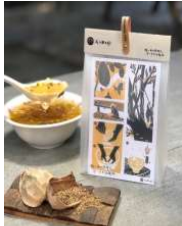
Figure 3. The picture shows the results of cooperation between young people engaged in the management of agricultural products and young people engaged in visual design.