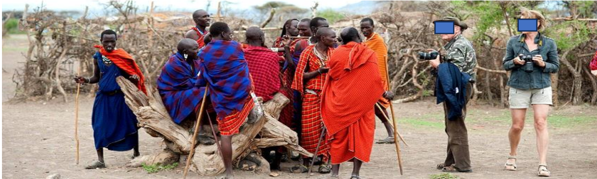
Figure 1. Visitors experiencing cultural heritage tourism in Serengeti National Park