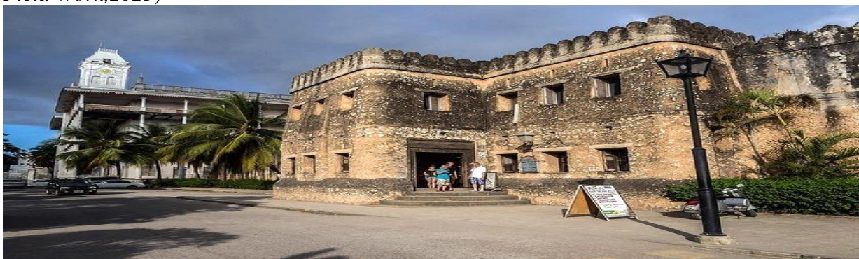
Figure 2. Monument at Stone Town of Zanzibar