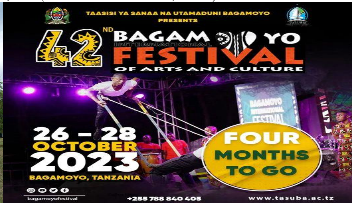
Figure 3. Boma Building and Cultural Festival at Bagamoyo

Also, another successful case study of cultural heritage tourism in Tanzania is Bagamoyo, Bagamoyo Historical Town in Tanzania is a UNESCO World Heritage Site and a significant destination for cultural and heritage tourism [6,2]. The town played a crucial role in the transportation of slaves to the Arab world and beyond, and it also served as a base for explorers like David Livingstone and Richard Burton. Bagamoyo boasts a wealth of historical buildings, including old German colonial structures, Swahili-style houses, and mission churches [6]. Visitors to Bagamoyo can explore several historical sites, including the Kaole Ruins, the Old Fort, the Bagamoyo Museum, and the Catholic Mission. These sites offer insights into the town's past and the impact of the slave trade. Bagamoyo offers a Slave Route Tour, which guides visitors through the history of the slave trade, including visits to former slave holding areas and informative exhibitions. Cultural festivals and events, such as the Bagamoyo Arts