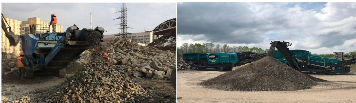
Figure 5. Reinforced concrete crushers. [14]

According to the Steel Recycling Institute, today more than 65% of rebar is recycled worldwide, over 7 million tons of scrap iron are recycled into reinforcing bars each year, and nearly 100% of the raw material used to produce rebar comes from recycled ferrous waste. These aspects are particularly important in view of the depletion of natural resources. Recycling of these materials is carried out with the help of specialized equipment (figure 5), [14] such as crushing plants (jaw crushers, impact crushers, hammer and cone crushers, into the chambers of which pieces of reinforced concrete of limited dimensions can be loaded) and sorting or technological lines. Crushing and screening lines are usually stationary equipment, while complexes can be mobile. It is certainly more efficient to use mobile units, as they can be transported directly to the construction site, thus reducing the costs of transporting waste to collection centers. The extraction of metal reinforcement inclusions is carried out by screening. After crushing, the crushed stone of a certain fraction falls onto the pallet, while the metal remains on the grid, which is subsequently collected, crushed and sent for melting. The same technology can use a magnetic separator to separate metallic materials found in crushed reinforced concrete directly from the conveyor belt.