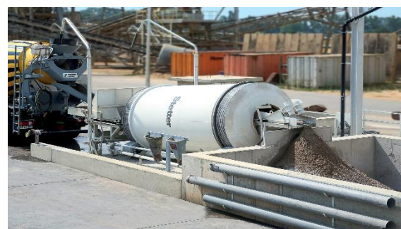
Figure 3. Concrete crushing. [14]

Recycled reinforced concrete can contribute to reducing the use of raw materials, which will result in the conservation of natural resources and a net reduction in greenhouse gas emissions. For example, the production of one ton of steel reinforcing bars requires approximately 2,500 kilograms of iron ore, 1,400 kilograms of coal, and 120 kilograms of limestone. Taking into account the fact that the used reinforced concrete cannot be used in the resistance structure of a building, with the same efficiency, it will be recycled to be reused in