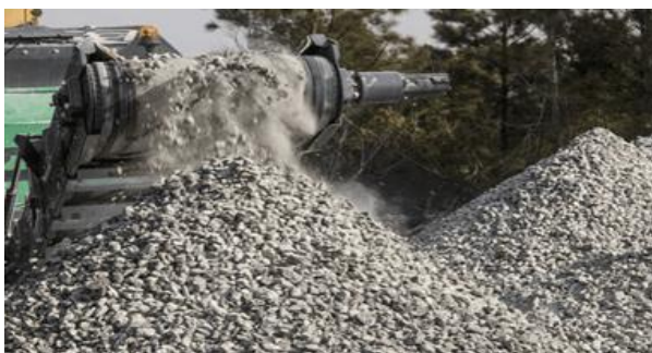
Figure 4. Fixed concrete recycler. [14]

Recycled concrete is obtained from used concrete from demolitions, crushed (figure 3), sorted by magnetic separators, sieves and/or optical sensors, and in some cases the aggregates are treated with sodium silicate to increase their adhesion to the new binder. It is used in the construction of roads and highways (as a base layer or fill), in prefabricated elements (masonry blocks). The advantages include: reduced extraction of natural aggregates, strength approximately equal to standard concrete. Another alternative would be to transport the concrete resulting from demolitions to a special crushing station (figure 4), obtaining recycled aggregates for use in infrastructure.