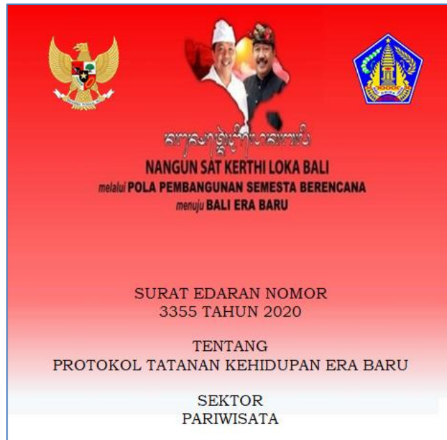
Fig 3. Circular Letter Number 3355 of 2020 Concerning the New Era Protocol for the Bali Tourism Sector

The Virtual Hotel model contains minimal elements of the hotel icon associated with the superior location of the hotel associated with mountains, Sungai, lakes, beaches, heritage, ancient buildings and the like, hotel profile which contains the type of rooms, additional facilities such as swimming pools, restaurants, cafes, spas, and the like. And also include the location of the hotel, the superiority of the hotel with the surrounding hotels, as well as the distance from the city center (see Figure 2).