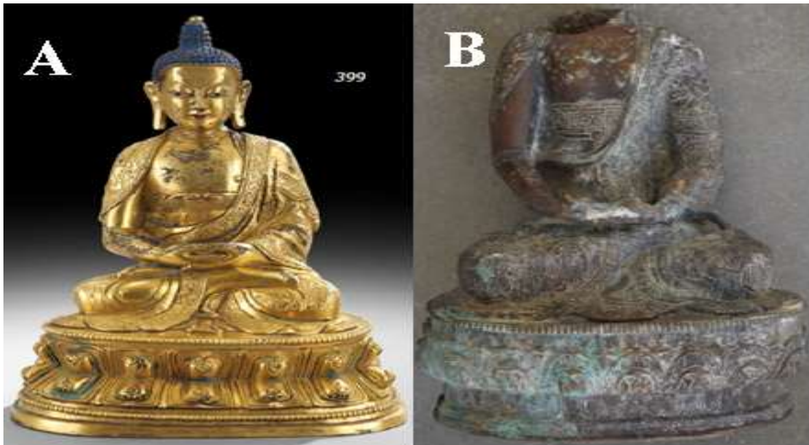
Figure 3: (A) Chinese Buddha gilt copper sculpture of the 19th century [13, p. 88]. VS (B) Bharja Sculpture