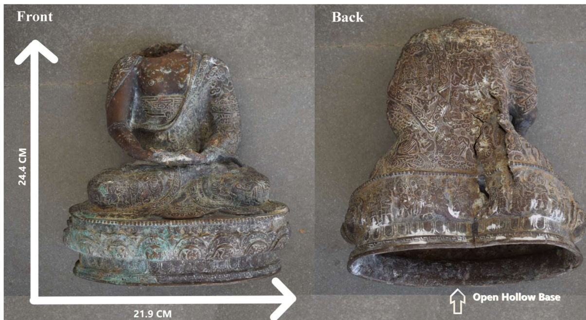
Figure 1: Front and Backside of unearthed Buddha Sculpture

This hollow Buddhist sculpture without the head is a very rare one. It has exquisite beauty engraved or super-imposed over its visible crust. This bronze alloy sculpture is made up of metals like copper, tin, iron, lead etc. The crust has corrosion of green colour and rust of red colour in blend. Superimposed stories are related to the Buddhacharita and Jatak Tales . From the backside, the sculpture has a dent with a crack in the lower middle, a small crack in the right-hand elbow joint, and the head is missing, a small hit mark near neck shows that there is a possibility of intentionally removing of head or victim of vandalism. On the contrary, the sculpture is hollow from inside but it is very strong and heavy in weight.