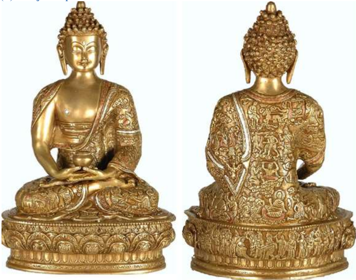
Figure 4: Replica of Tibetan Art statue Buddha sculpture [14]