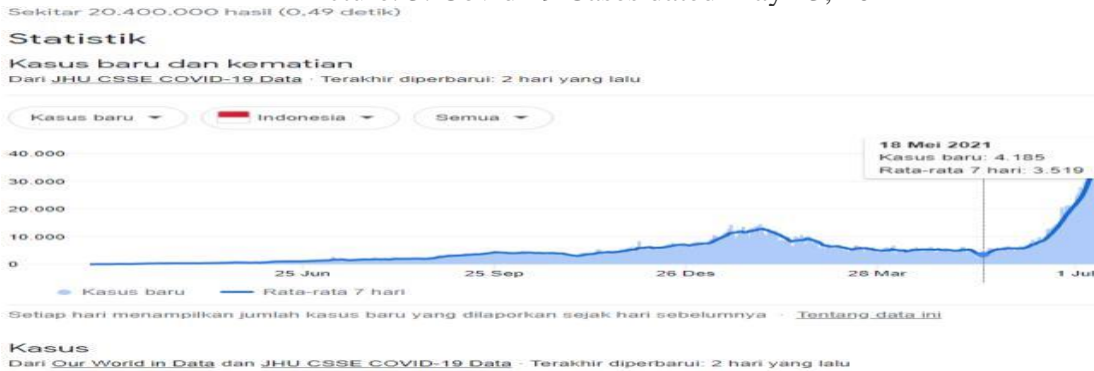
Picture. 4 Cases of Covid 19 dated May 18, 2021

By comparing Figures 3 and 4, the data appears on the 13th. May experienced the beginning of the decline even though the date is Iedulfitri and continued to fall until May 18, 2021, maybe the success of the policy of homecoming ban, then increased steadily until finally applied PPKM as of July 3--20, 2021.