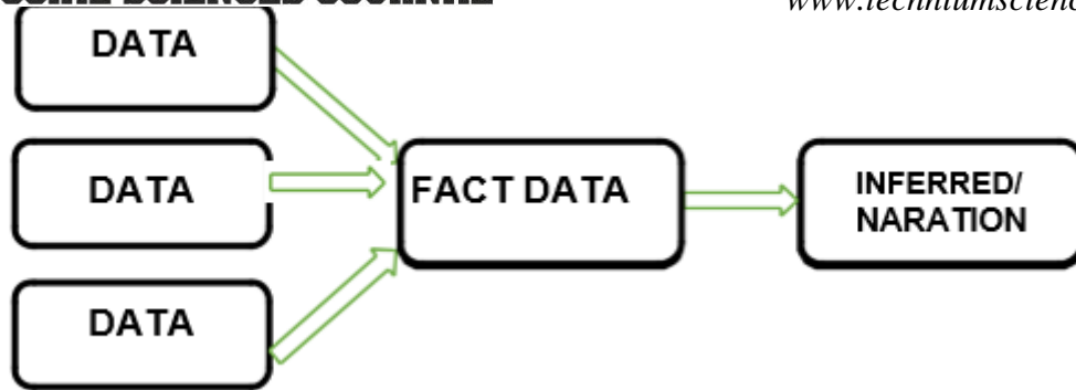
Figure 1. Triangulation Proses