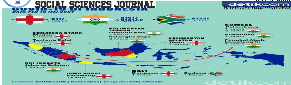
Figure 2. Spread of 3 New Variants of Covid 19 in Indonesia