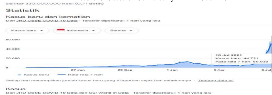
Picture. 6 Cases of Covid 19 dated July 20, 2021

Comparing figures 5 & 6, since the implementation of PPKM on July 3, 2021, an average of 7 days 23,270 and until July 12, the average of 7 days 50,039 after running 10 days does not appear to decrease even continue to increase.