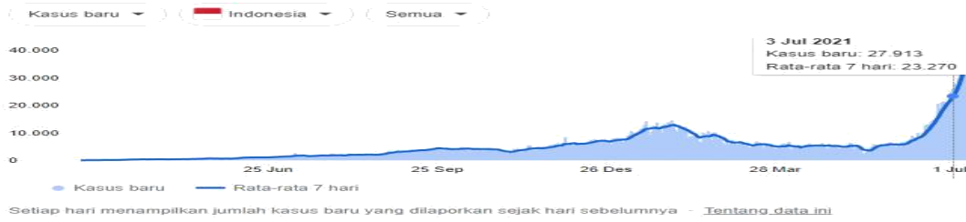
Picture. 5 Cases of Covid early PPKM 3Juli 2021

Dari JHU_CSSE_COVID-19_Data · Terakhir diperbarui: 2 hari yang lalu