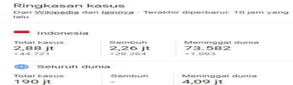
Picture. 7. Case Summary

Comparing figures 5 & 6, since the implementation of PPKM on July 3, 2021, an average of 7 days 23,270 and until July 12, the average of 7 days 50,039 after running 10 days does not appear to decrease even continue to increase.