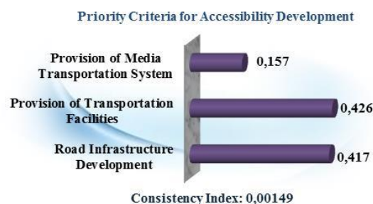
Figure 4. Most Priority Accessibility Criteria

d) Fourth, the promotion aspect. Promotion is also one of the important aspects to inform or offer tourism products and services with the aim of attracting tourists to the destination of