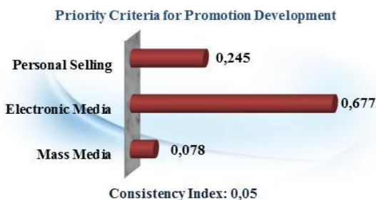
Figure 5 The Most Priority Aspects of Promotion Criteria are developed

Jembayan Village. To measure the aspect of promotion there are three criteria that are assessed including mass media, electronic media, and personal selling. The results of the study related to the three criteria showed that the most priority criteria related to the aspect of promotion were promised by using electronic media with a priority vector value of 0.677 greater than the criteria of mass media and personal selling. This is closely related to the development of information technology today. Most tourists are those who are very understanding of how to use electronic media so as to be able to encode information related to the chosen tourist destination. Thus, the most priority promotional media to be used as a promotional tool is through electronic media, such as websites, Instagram, Twitter, Facebook, and some of it. In detail, the criteria of the most priority aspects of promotion to develop are as follows: