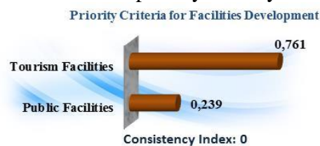
Graph 3 The most priority facility criteria

c) Third, accessibility. The accessibility aspect is one of the components of tourism that is very important in supporting the movement of tourists from the area of origin of tourists to tourism destinations and the movement of tourists within the tourism destination area. To measure the accessibility aspect there are three criteria that become indicators of assessment, namely the development of road infrastructure, the provision of transportation facilities, and the provision of transportation systems. Based on the results of research on the three criteria showed that the most priority criteria to be developed is the second criterion, namely the provision of transportation facilities to and from the Jembayan tourist village with a priority vector value of 0.426 greater than the development of road infrastructure and the provision of transportation systems. Thus, the means of transportation play a very important role in the development of Jembayan tourist village, this is because until now there are no public transportation facilities to and from Jembayan Village, so until now tourists who visit there use private transportation. In detail the criteria of the most priority aspects of accessibility development are developed are as follows: