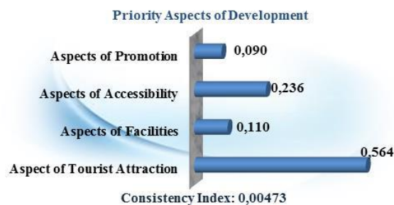
Graphic 1. The Most Priority Aspects of Development

3. The third level is an analysis of the criteria of the following four priority aspects of development: