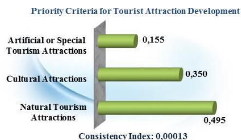
Graphic 2. The most priority tourist attraction

b) Second, the facility aspect. Aspects of facilities consist of two criteria, namely public facilities and tourism facilities that must be developed and provided in the tourist destinations of Jembayan Village. Public facilities are the basic physical means of an environment intended