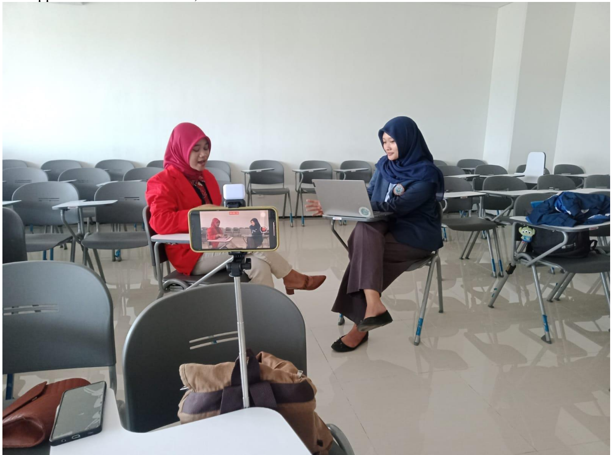
Figure 1. Interview About Disgraceful Acts

To support the research results, interviews were conducted with several students