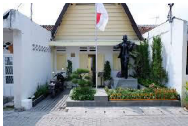
Figure 3. Rumah Persembunyian W.R. Soepratman, saat ini sudah menjadi museum.