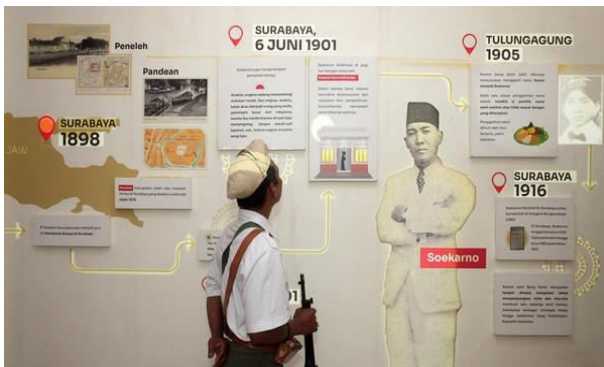
Figure 1. Sukarno's Historical Chronicle